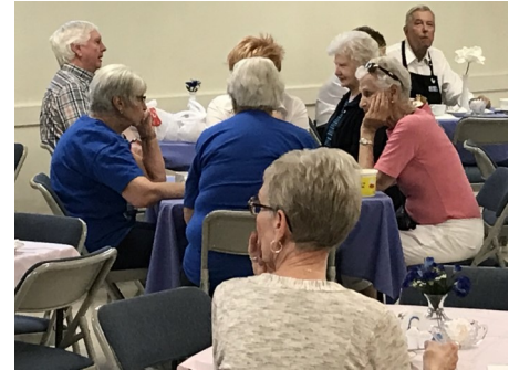
Heritage Seniors Strawberry Tea