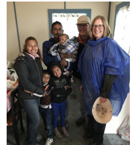
The grateful family