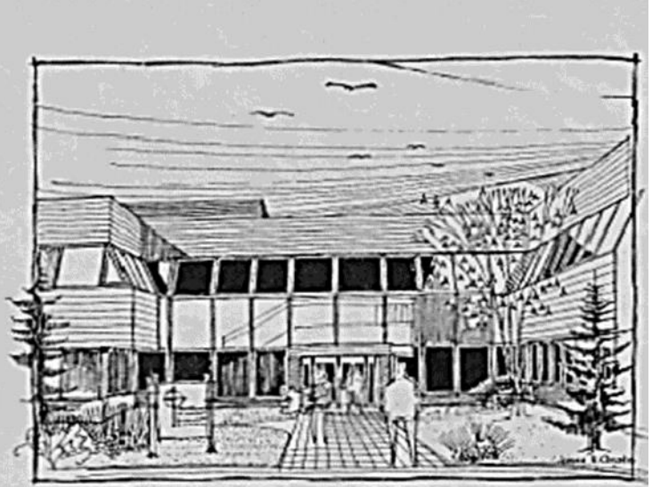
Rented facilities at Midnapore

The satellite concept is simple ... and important. Under its precept, there is one congregation, one Session, one Board of Managers, one staff, one resource base, and one Treasury. There are two Ministers, one who is fully involved in the life of the home church, but with participation in the project, and one who has prime responsibility for the extension project and is involved with the home church. Sunday School and adult programs are in place so that when a family or individual comes to the Midnapore location, they have access to all.